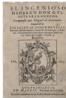
FIRST EDITION COVER of DON QUIXOTE : 1605