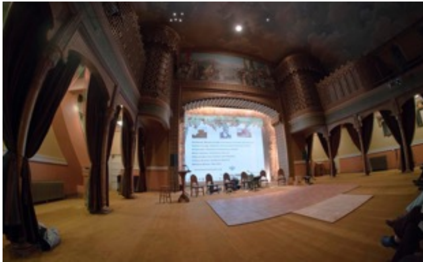
SCOTTISH RITE THEATER, SANTA FE, NM